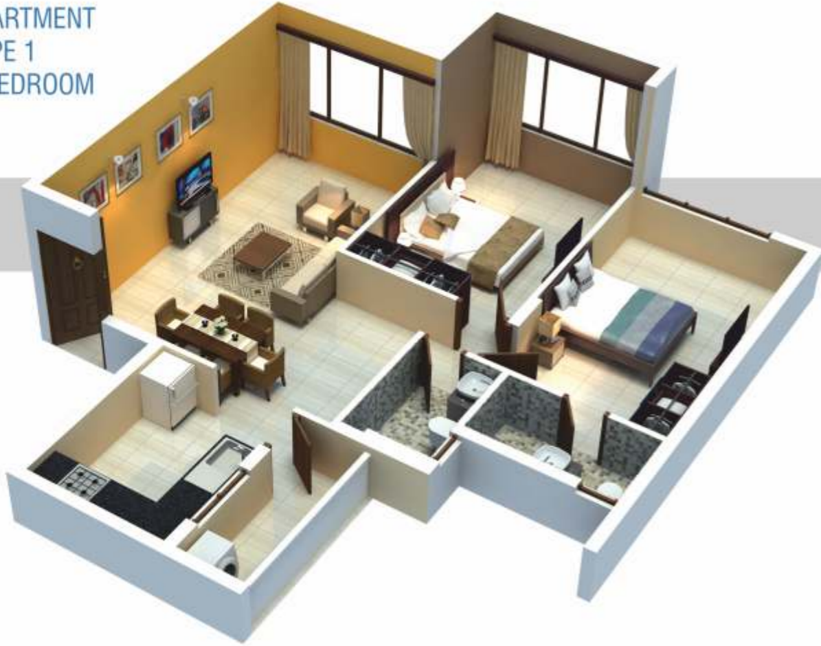
APARTMENT TYPE 1 2 BEDROOM